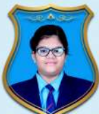
HUSNA S M 542 / 600