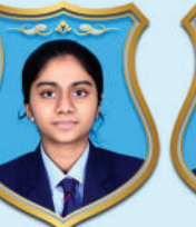
USHA C 570 / 600