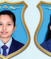
POORNIMA 569 / 600