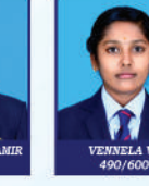
VENELA V 490/600