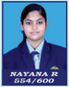
NAYANA R 554/600