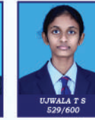
UTWALA T S 529/600