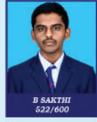
B SAKTHI 522/600